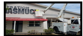
SPRUCING UP OUR NAME!

Bank of America St. Patrick's Catholic Church