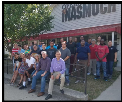
TLAA Fiesta Feast gathering

The Lodge Alumni Association ("TLAA") was formed to connect Lodge graduates and men who are currently in the program. No one can tell the story of breaking the cycle of homelessness better than our men who battled for the life God intended. Lodge graduates hold leadership roles in the Association and plan quarterly cookout gatherings sponsored by our generous volunteers and supporters.