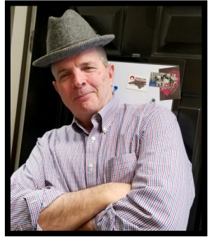
Classy but Sassy