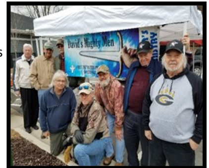
Thank you, David's Mighty Men, of First Presbyterian for sponsoring a cookout!

Through these gatherings, God demonstrates His love and offers hope through people who care.